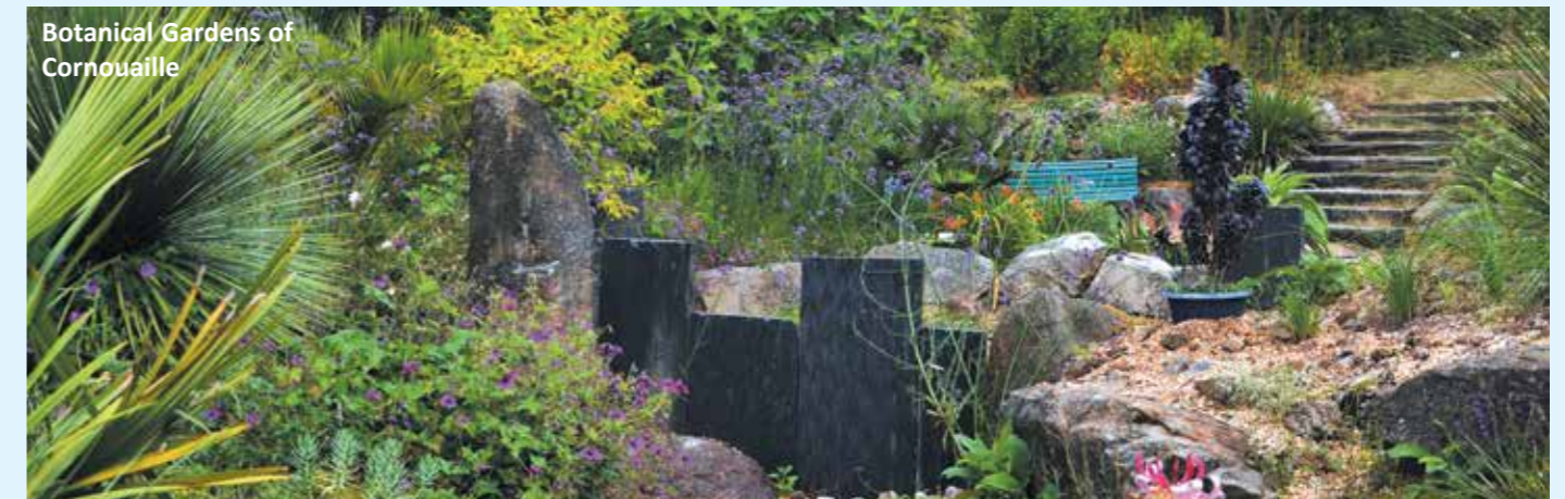
Botanical Gardens of Cornouaille

To book this cruise call now on 0800 170 7233 quoting Gardens to Visit, or for more information Email vanessa@connoisseur-travel.co.uk